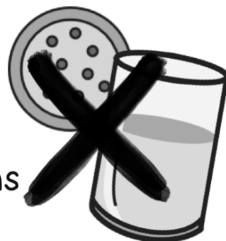
RAMADAN VOCABULARY TABLE

Fasting is not just about not eating! When Muslims fast they avoid all bad habits and try to focus on being the best versions of themselves.