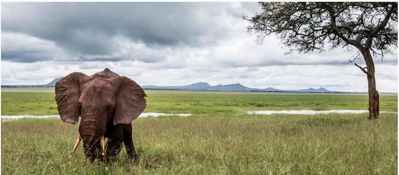
An elephant in Tarangire National Park, Tanzania.