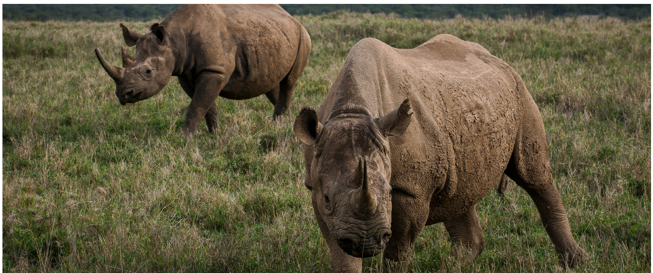
Eastern black rhinoceros females, Ol Pejeta Conservancy, Kenya, Africa.