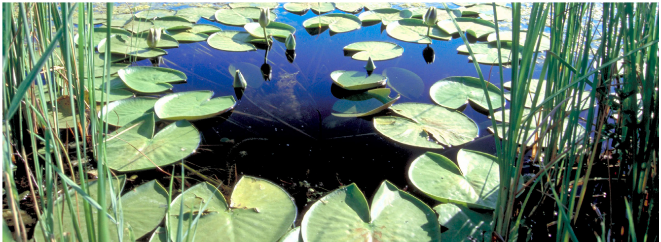
Water lilies on marshes along the Danube River near Wilkowo, Ukraine.