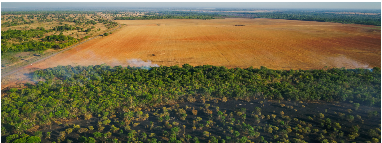
Deforestation to make room for cornfields, Brazil.