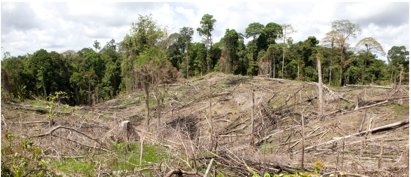
Deforested land, East Kalimantan, Borneo.