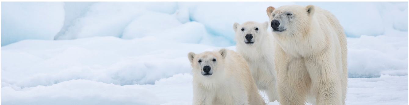
Polar bear mother and cubs walking on ice flow in Svalbard, Norway.

Poaching wildlife for illegal trade is an urgent threat facing hundreds of the world's most beloved species, such as elephants, rhinos, and tigers. These animals are illegally hunted for their fur, tusks, horns, bones, and other parts. Illegally obtained animal parts and products are trafficked by international criminal networks, much like illegal drugs and weapons. This business continues to skyrocket due to an increasing demand, particularly in Asia where these animal parts are often seen as a status symbol and used in medicine or carved into trinkets. In addition to elephants, rhinos, and tigers, countless other species such as sea turtles, pangolins, birds, reptiles, primates, and timber trees are similarly illegally exploited.