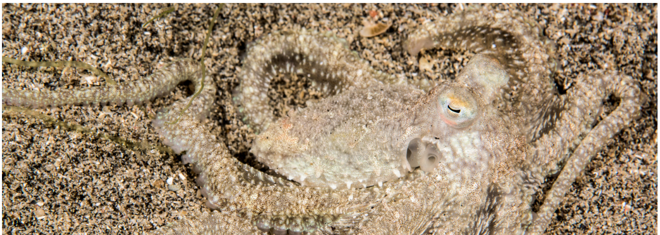
An octopus, Indonesia, uses camouflage to protect itself against predators and hide from its prey.