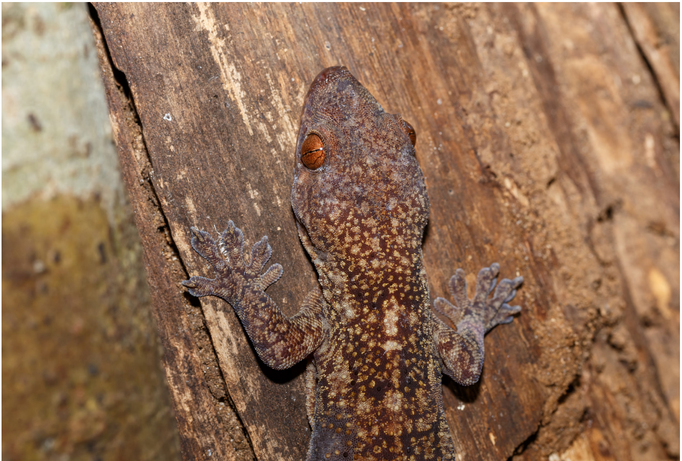
Mossy leaf-tailed gecko, Madagascar, uses camouflage to blend into its surroundings.