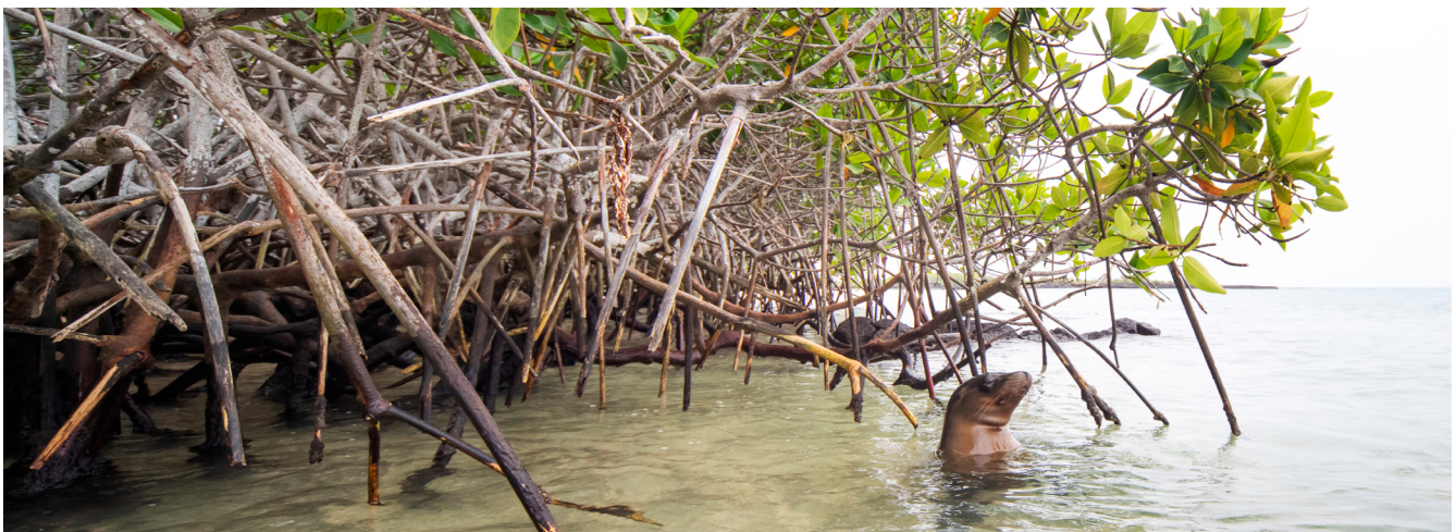
Galápagos sea lion swimming near mangroves, Floreana Island, Galapagos, Ecuador.