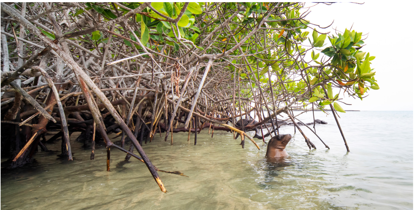
Galápagos sea lion swimming near mangroves, Floreana Island, Galápagos, Ecuador.