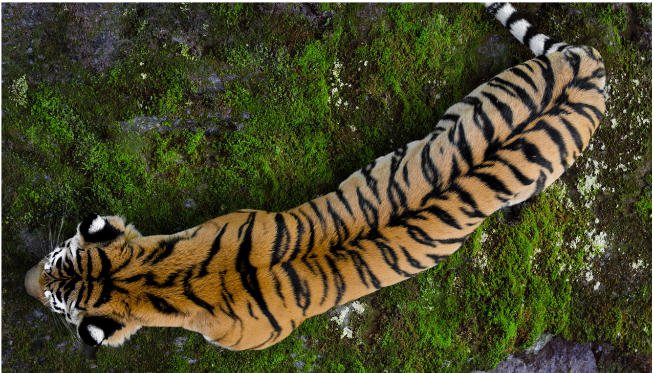
Tiger, Ussuriysk, Russia.

For more fun classroom activities with a focus on wild species and conservation, visit wildclassroom.org .